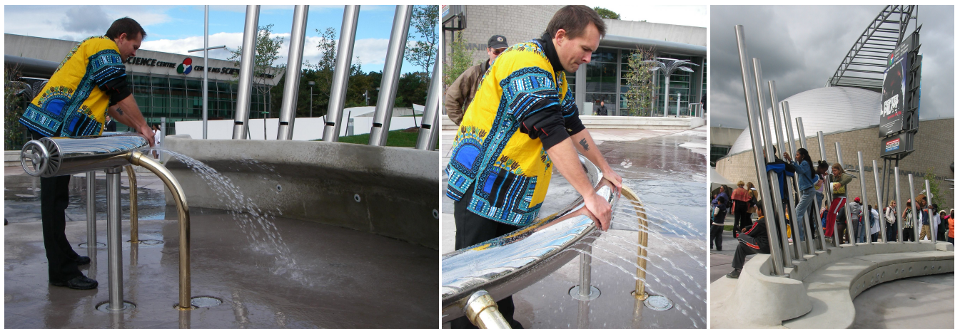
Fig. 2: Example of hydraulophone installed in a public space: This hydraulophone is the main centerpiece out in front of the Ontario Science Centre, the world’s first and largest science museum.

made to become louder than the other notes in the chord, and then, while sustaining that same chord, the loud note is made quieter and a the next melody note in that same chord is made louder, and so-on, dynamically, to follow along the course of that portion of the melody that falls within the chord.