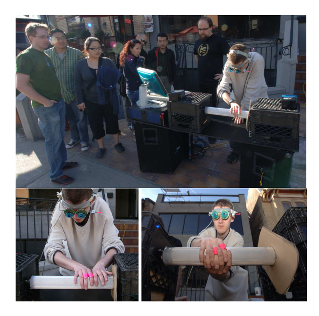
Figure 7. Polyphonic friction-idiophone having continuously variable pitch: A spinning aluminum cylinder with a specially textured surface produces sound picked up by a wireless contact microphone inside the cylinder. The sound is fed to one or more (depending on the number of fingers touching the cylinder) bandpass filters controlled by computer vision. The instrument can be used above or below the surface of the water.