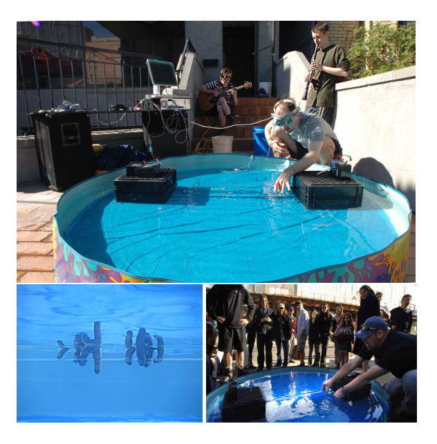
Figure 8. An underwater friction-idiophone based on total-internal reflection: Underwater (plus optional overhead) cameras "look" at a glass cylinder. Placing the camera further underwater than the cylinder, and having it look up at an angle, makes it possible to see the fingers as they disturb the evanescent wave of total internal reflection. This gives rise to a hyper-sensitivity in the image plane, making visible subtle sound-induced ripples in the water that occur from sound vibrations in the glass cylinder. With carefully constructed computer vision, the camera can thus function as an optical pickup of acoustic phenomena, much like an electric guitar having an optical pickup. Together with an array of geophones, hydrophones, and microphones, this provides a multiply acoustic instrument having a richly acoustic physicality.

We believe, therefore, that instruments like the idioscope are not members of the Horbostel Sachs 5th Radiophonic/Electrophone category [Sachs, 1940] any more so than is an electric guitar with effects pedals, or a Steinway