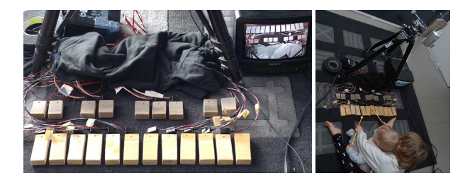
Figure 3. Making a bell-like sound from a dull thud: An array of wooden blocks is setup on a carpet. Each one is fitted with a separate acoustic transducer fed to a separate bandpass filter having transfer function equal to the quotient of the desired bell sound and the sound made by actually hitting the block.

the medium of sound production and the surrounding medium in which the sound is produced. Thus an underwater glockenspiel is no more a hydraulophone than it is an aerophone when it is operated in air (i.e. above the water's surface).