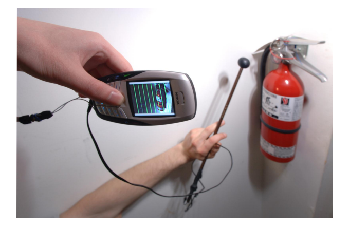
Figure 6. A 12-bar idioscope running on a camera phone: One or two drumsticks or mallets with contact microphones plug into the headset input of a standard cameraphone. While listening to earphones, the player strikes an object in view of the camera. There are 12 vertical zones, each defining a separate note on the musical scale. The player can walk down the street and strike street signs, lamp posts, and the like, as part of a live performance webcast in real time. Here the player is locating a fire extinguisher through one of the 12 zones defined in the camera phone view and hitting the extinguisher with the mallet. Whatever pitch is produced by the sound of hitting the extinguisher is filtered and frequency-shifted to the desired note, so that all 12 notes can be produced by hitting this one fire extinguisher or other similar everyday objects.

While playing glass harp underwater, we found that the water imparted some nice attributes to the sound, but we wanted some additional versatility, and the option to have a high Q-factor (less damping) at certain times during our