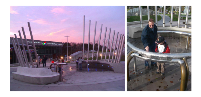
Figure 2. The main architectural centerpiece in front of Ontario Science Centre is a fountain that is a hydraulophone, approximately 10 metres in diameter and 20 feet high. This hydraulophone is reedless, but other hydraulophones include the Clarinessie (single reed), the H_2 Oboe (double reed), and a wide variety of underwater orchestral instruments.

• The H <sub>2</sub>Oboe (TM), an instrument having more than one reed associated with each note.