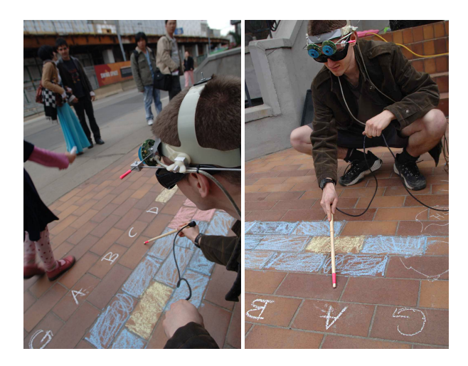
Figure 5. Sidewalk bricks or pool tiles cum tubular bells: Cyborg street performance using wearable camera rig and computer vision to control the transfer function of virtual effects pedals. A Wah-Wah like virtual effects pedal filters the acoustic sound of sticks hitting concrete. Filter transfer functions can be changed to achieve sounds of church bells, glockenspiels, piano, etc., but the sound all originates acoustically, thus remaining in the idiophones (not electrophones) top-level.

the player the option of either hanging the camera rig from a tripod (or similar mount above a desk), or wearing it. When worn, the player has the benefit of an infinitely large playing area, by simply assigning different transfer functions to a limitless library of real physical objects.