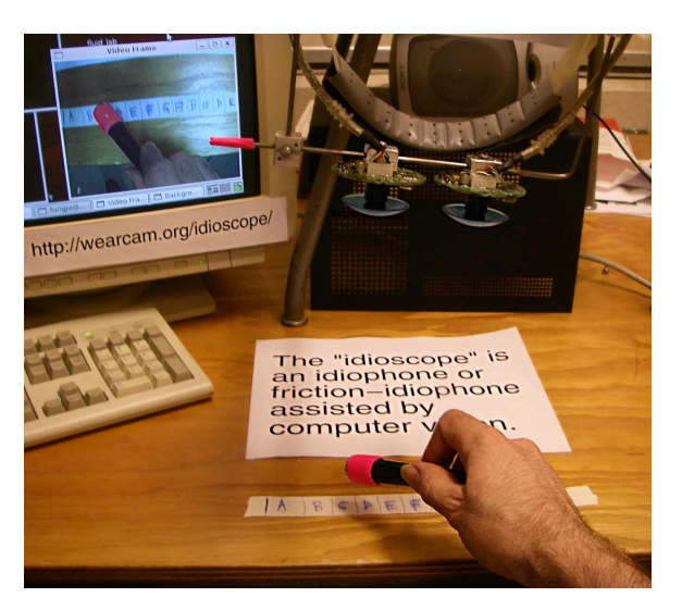
Figure 4. Making a bell-like sound from hitting a desk: A computer music system that is not an electronic instrument. Sound originates acoustically, and the role of the computer is merely for post-processing (much like a Wah Wah pedal on a guitar). The center frequency of the filter's passband varies with position, as detected by the overhead camera rig. Note the wearable stereo camera rig hanging from a fixed location. The cameras can be mounted to a tripod, or worn by the player.

Note that the range of expression is much more diverse than merely velocity-sensitive triggering of a recording of a bell sound where amplitude varies with strike velocity. For example, rubbing the sticks against the blocks (rather