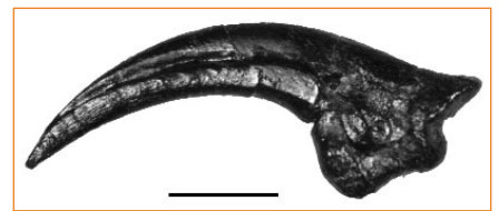
Figure 2 Manual ungual of a theropod dinosaur from the Kuwajima Formation (Valanginian or Hauterivian) of Shiramine, Ishikawa Prefecture, Japan. Note the prominent lip posterodorsal to the articular surface of the ungual, a synapomorphy of the clade Oviraptorosauria + Therizinosauroidea 5 . Scale bar, 5 mm.

These Japanese discoveries, combined with the presence of late Early Cretaceous taxa in the Yixian Formation (such as the ornithischian dinosaur Psittacosaurus 10 ), suggest that several dinosaur clades (such as tyrannosaurids and psittacosaurids) may have originated and diversified in eastern