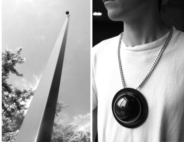
Figure 2: Surveillance and Sousveillance: Surveillance is French for watching from above ("sur" meaning "from above" and "veiller" meaning "to watch"). Surveillance denotes the God's eye view of the proverbial "eye in the sky". Sousveillance brings the cameras from the heavens down to earth, i.e. from the lamp posts and ceilings, down to human level.

, but, rather, it is a construct that acknowledges the postmodern world in which we live. (See http://wearcam.org/sousveillance.htm ) (See Fig 2)