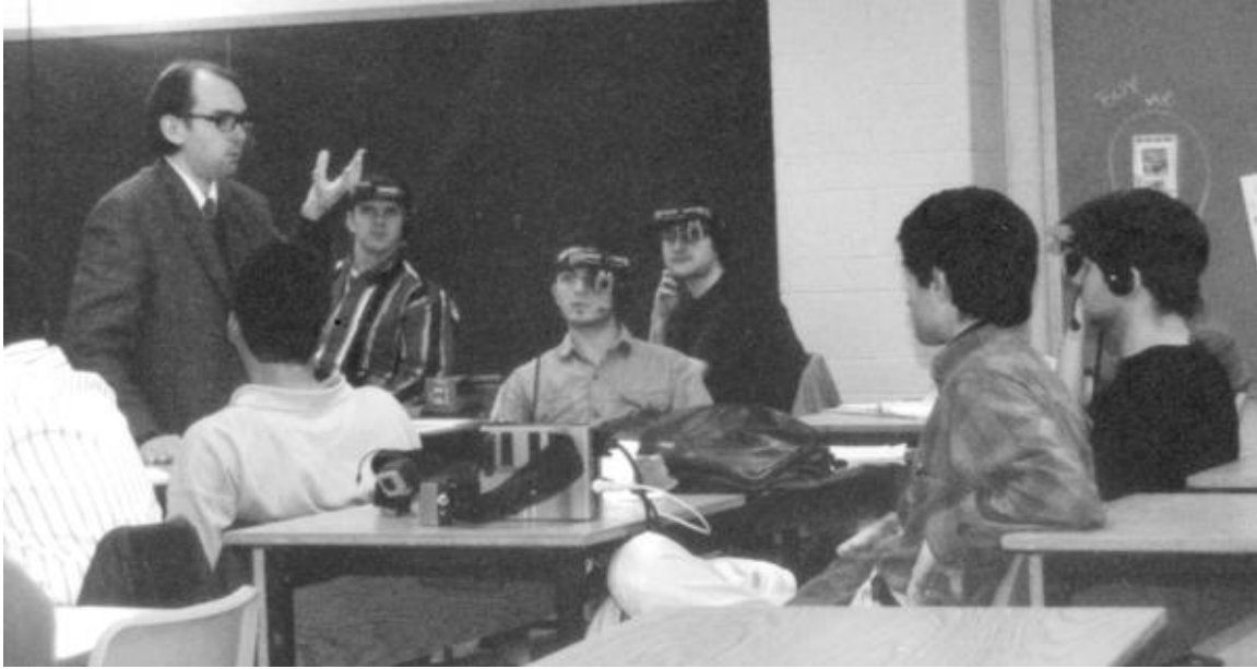
Figure 1: Wearing my eyeglasses which embody the EyeTap technology of both image capture and image display (the special glasses look just like ordinary bifocal eyeglasses) I teach a class of about 20 students, how to become one with the machine. Here I teach how to use the standard Xybernaut wearable computer product. I also teach the students how to build their own systems, and many of the new scientific principles in the emerging field of Personal Cybernetics .