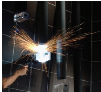
Plasmaphone Plasma "H 2 O" ("Lightning")