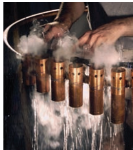
Idratmosphone Gas H 2 O (Steam)