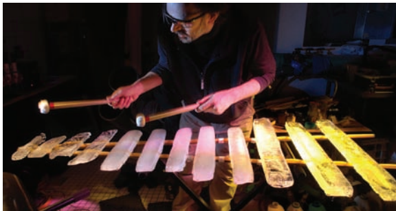
Pagophone Solid H 2 O (Ice)